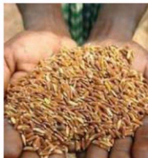
Activists have demanded allocation of 14 kg per person.

"Smaller households receive a higher per-capita entitlement, whereas larger households receive a lower per-capita entitlement, which may fall below the entitlement available to priority households," the notice adds. The government maintains that the aim and purpose are to remove "intra-category inequities,