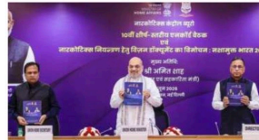
Home Minister Amit Shah releases the vision document on narcotics control during the 10th apex-level meeting of the NCB.

He addressed the 10th apex-level meeting of the Narco-Coordination Centre (NCORD) organised by the Narcotics Control Bureau (NCB).