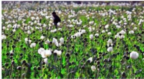
Illegal trade: Myanmar's illicit opium cultivation expanded by approximately 56% between 2021 and 2023.

mechanisms, including the Free Movement Regime (FMR) along the India-Myanmar border, have created conditions under which these States under transitioned from peripheral transit zones to active staging grounds for distribution of narcotics into the Indian hinterland.